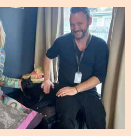
Te Waipounamu's tips for Working well