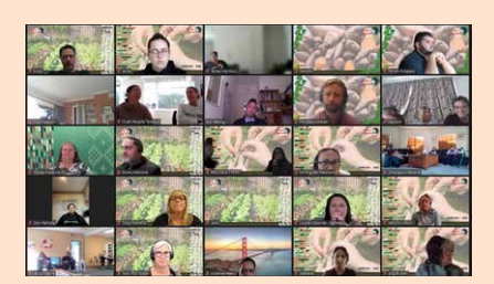
Hundreds of kaimahi, whai ora and taiohi joined virtually from across the motu.