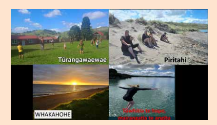
Teams in Te Manawa Taki shared how they keep Spiritually well.