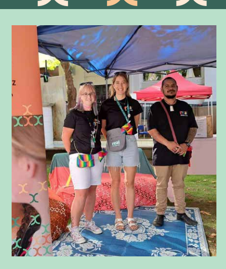
The Whetū Marewa Whanganui team